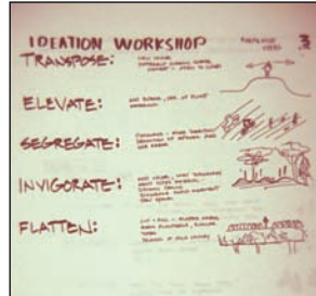
An exercise in translating verbal ideas into visual form

In one successful use of a creative device, role playing, students wrote narratives about a place. They used rush-writing—writing constantly about anything that came to mind in a 10-minute period. They then circled keywords in their texts. In another use, students wrote narratives about the place they would design; one student wrote and illustrated a postcard to her children. Whatever the creative device, the essential design step was translating verbal ideas into visual representations.