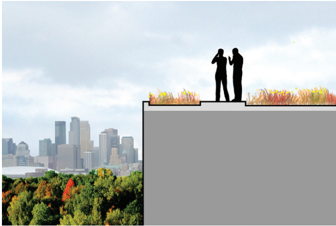
Section diagram of a green roof