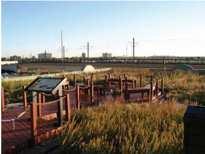
The roof of The Green Institute in Minneapolis, Minnesota