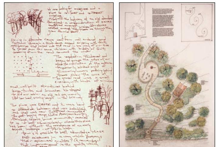
Teaching design skills: from verbal to visual form