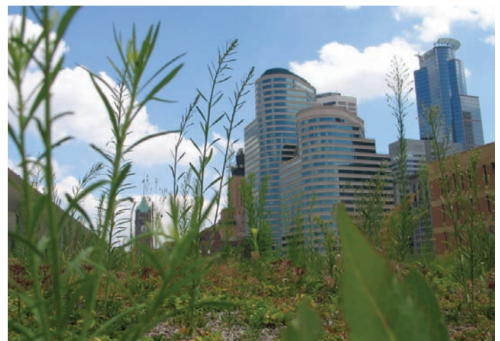
Roof of the Minneapolis Central Library, Minnesota

Controlling noise is another reason to choose green roofs. Soil, plants, and the air layer trapped between the green roof assembly and the building surface provide sound insulation. The substrate blocks lower frequencies, while the plants block higher frequencies. This can mean a reduction in indoor sound levels of as much as 40 decibels, an important difference to those who live near airports, major highways, or other forms of industrial-related noise pollution. Additionally, wind moving through the stems and leaves on green roofs can provide masking noise or create a beneficial soundscape.